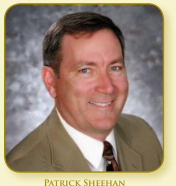
Attorney at Law