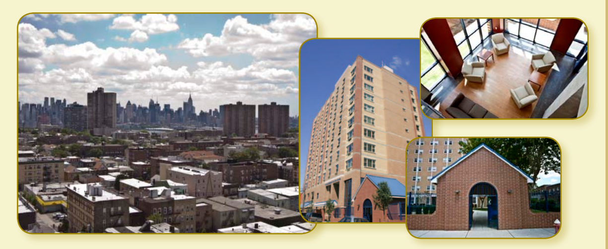
Kennedy Towers (shown above) was developed with the assistance of HMFA's Federal Low Income Housing Tax Credit Program

There was a real learning curve in producing the affordable housing. I had to learn how to manage multiple sources of financing, as well as pulling together all of the information that is needed to apply for tax credits. The process is a real public/private partnership wherein you need the local government, the county, the state and federal government, as well as a tax credit investor. I am very proud that we were successful in obtaining the tax credits and opening our 70-unit senior building for which 20% of the units are occupied by the frail/ elderly, which is a niche really needed in our community.