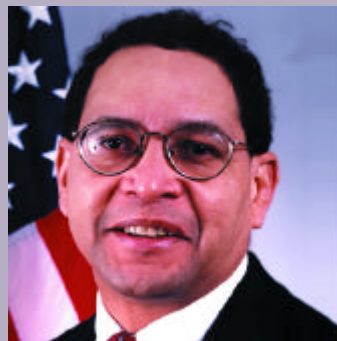
James Smith Acting Commissioner of New Jersey Department of Human Services