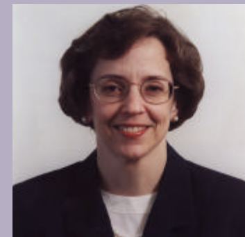
Karen Suter Commissioner of New Jersey Department of Banking and Insurance