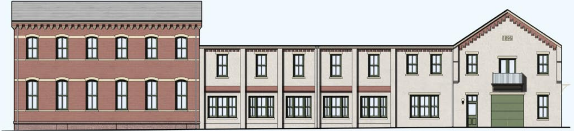
Artist rendering of the Cracker Factory