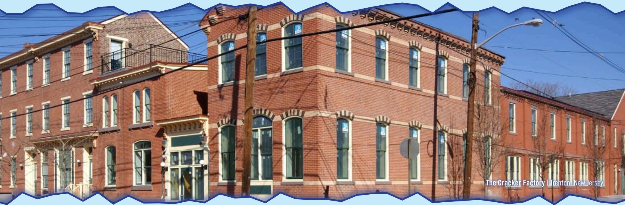
The Cracker Factory | Trenton, New Jersey