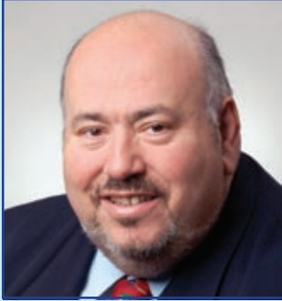
JOSEPH V. DORIA, JR. Commissioner Department of Community Affairs