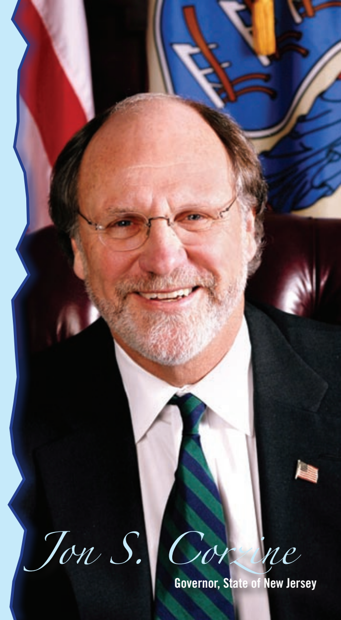
Jon S. Corzine Governor, State of New Jersey