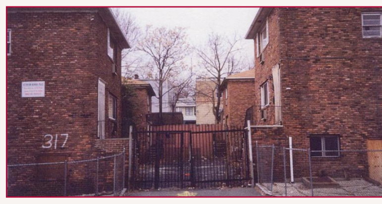
Before Construction: Osbourne Terrace looking into the courtyard.

66 Vision without action is a daydream. Hetion without vision is a nightmare.?? – Japanese Proverb