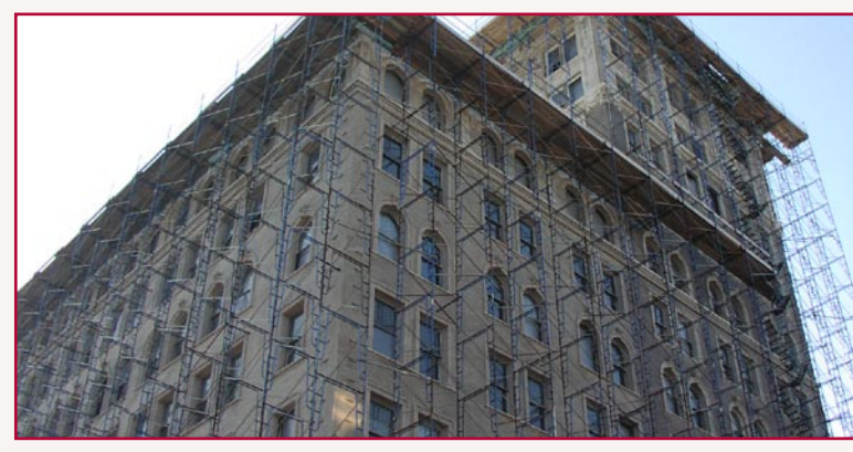
Broad Street Bank building undergoing renovations and green enhancements.

ituated in downtown Trenton, the historic Broad Street Bank sat vacant for many years. However the potential of this 1900s structure did not go unnoticed. Through the coordinated funding efforts of HMFA, the State of New Jersey and federal Low-Income Housing Tax credits, the 12-story building will be rehabilitated into 124 affordable and market-rate apartments with commercial space on the first two floors and a garden on the roof.