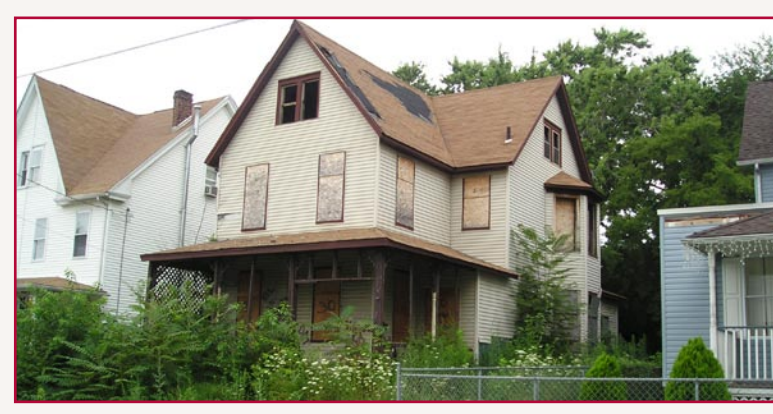
East Camden house prior to Extreme Makeover.

There is only one admirable form of the imagination: the imagination that is so intense that it creates a new reality, that it makes things happen. ?? Sean O'Faolain